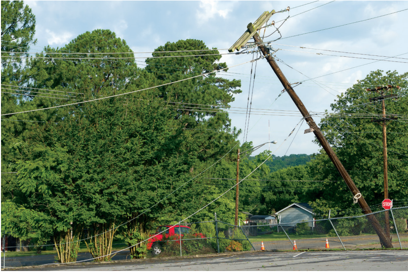
The speed and strength of Polecrete Stabilizer helps to quickly restore power.